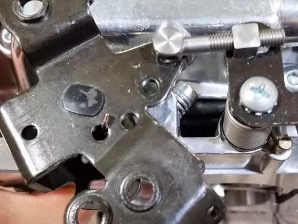
Original Sniper Linkage